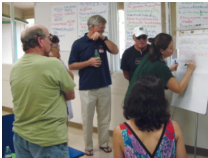
In April, Senator Tokuda and the Castle Foundation hosted a community meeting for Kawainui Marsh. In this break out session, the group is discussing challenges that may arise as they move forward on updating the Master Plan and possible solutions to those problems.

clause that was not clear before the purchase of a product or service. To address this issue, House Bill 663 would require clear and conspicuous disclosure of automatic renewal clauses and cancellation procedures of all consumer contracts.